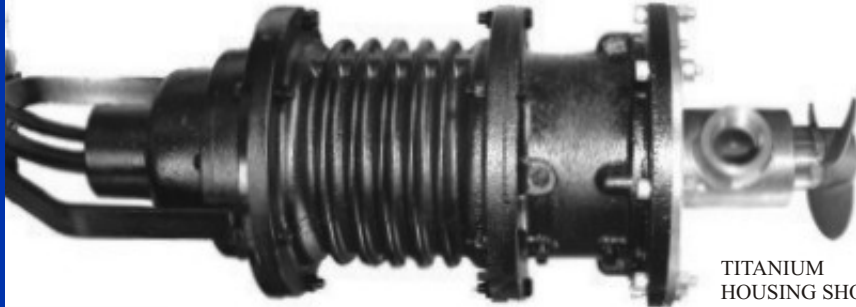
TITANIUM HOUSING SHOWN